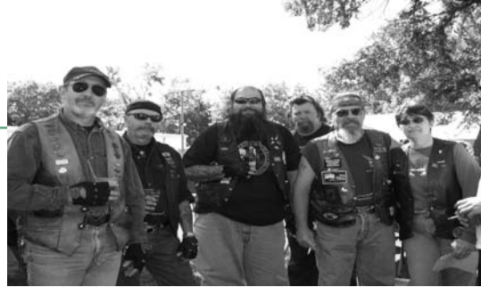
Benefit Ride Riders 2006