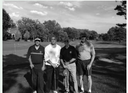
WINGS Golf Outing Participants 2006

In the same format as last year, the event will begin with lunch and a shotgun start. A dinner and auction (filled with sports memorabilia!) will follow. You'll even have a chance to win one of two Titleist Drivers with (Pro-Titanium 905R). With only 120 spots available you won't want to wait long to secure your spot. Individuals registrations are $475 and foursomes are $1,600. Sponsorship opportunities abound. For more information visit www.wingsprogram.com or call 847-908-0910 x21.