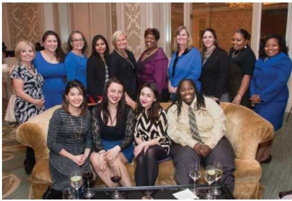
WINGS staff members are critical to our ability to serve others