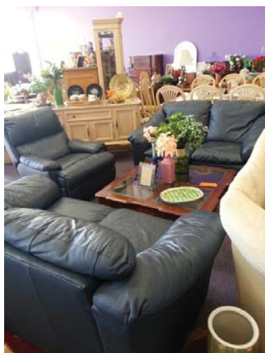
Furniture is also available