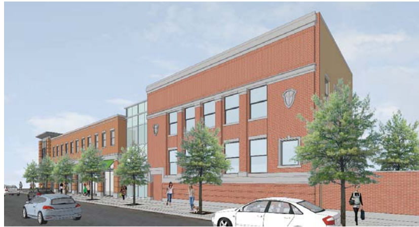
Architectural rendering of WINGS Metro

With the new shelter up and running, WINGS will increase the number of shelter beds in the City of Chicago by 36%.