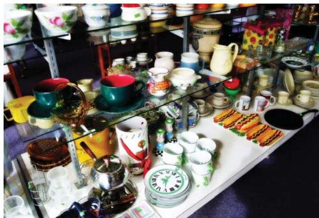
WINGS Resale Stores offer the best in resale merchandise

W INGS three Resale Stores provide critical income that allows us to carry out our mission of providing housing, integrated services, education and advocacy to end domestic violence. The resale store concept first became a reality in 1999 when WINGS staff decided to find the best use of the enormous influx of donations received through the kindness of the local community, businesses and groups.