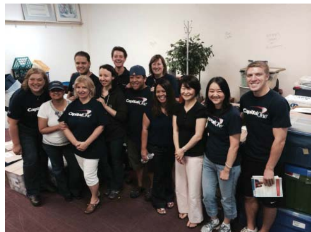
CapitalOne employees are also committed volunteers

If you are interested in hosting a Wish List Drive or making an in-kind donation, please contact Shelley Welch at 847-577-4668, extension 301 or swelch@wingsprogram.com .