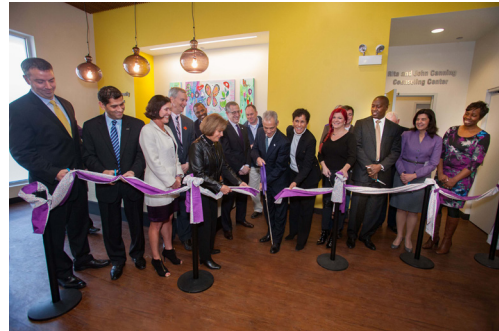
Official Ribbon Cutting at WINGS Metro