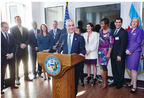
Mayor Rahm Emanuel helped WINGS open Metro

WINGS Metro features 40 shelter beds, the Verizon Café and Career Center, the Chicago Bears playground, the Allstate multi-purpose rooms, The Hearst Foundation conference room, Land of Nod playroom, laundry facilities and on-site counseling. Residents live at the Safe House at WINGS Metro for up to 120 days and can transition to an on-site apartment funded by the Chicago Low-Income Housing Trust Fund.