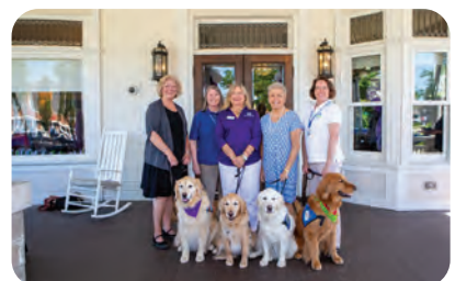
K-9 Comfort Dog Ministry, Lutheran Church Charities

K-9 Comfort Dogs greeted over 400 donors, volunteers and supporters who attended WINGS Open House Celebration. Guests had an opportunity to hear stories from four of our outstanding graduates, engage with WINGS staff and celebrate the successes we've had in breaking the cycle of domestic violence.