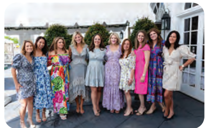
North Shore Ladies Luncheon Host Committee