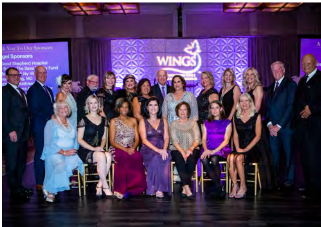
WINGS Board of Directors and Leadership Council Members at the Purple Tie Ball

May 2023 WINGS held an introductory event to spread awareness about domestic violence and WINGS solutions. A new Nashville Leadership Council is on the horizon which will focus on fundraising to create a domestic violence focused needs assessment for the city.