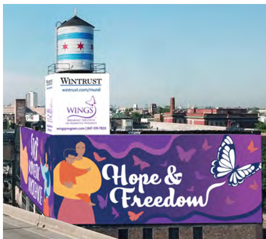
WINGS was honored to be featured on a mural on Wintrust building along Interstate 90