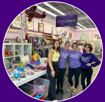
Displays at WINGS Resale Stores