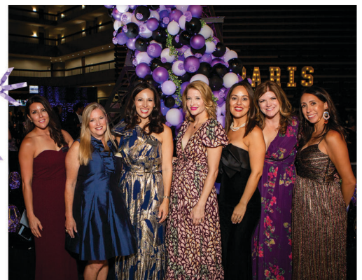
WINGS North Shore Leadership Council, PTB 2023