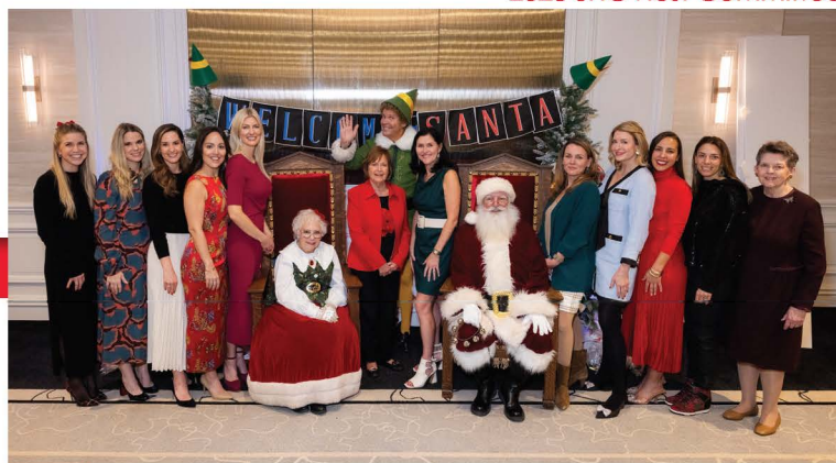
2023 SHC Host Committee