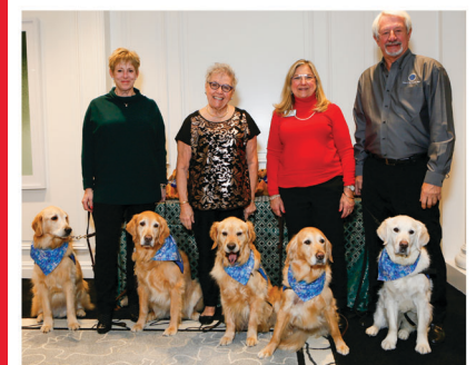
K-9 Comfort Dog Ministry, SHC 2022