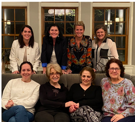
AND Leadership Council