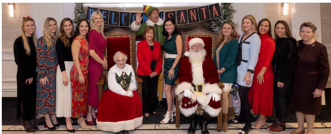
Sweet Home Chicago Host Committee with Buddy the Elf and Mr. and Mrs. Claus