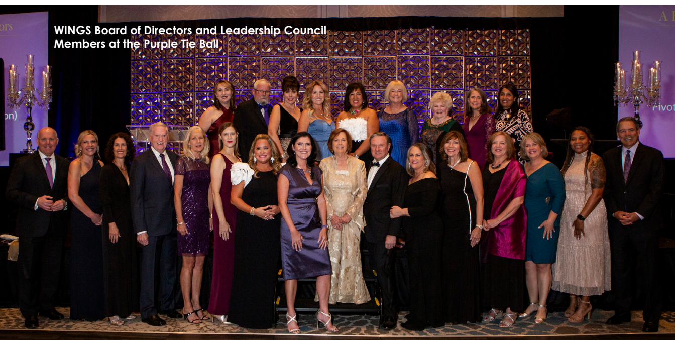
WINGS Board of Directors and Leadership Council Members at the Purple Tie Ball