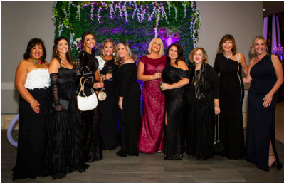
Purple Tie Ball Host Committee

Raised $1,365,742 toward WINGS housing programs and services for survivors.