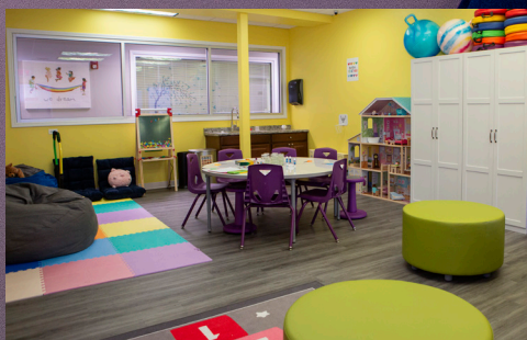
Children's group room