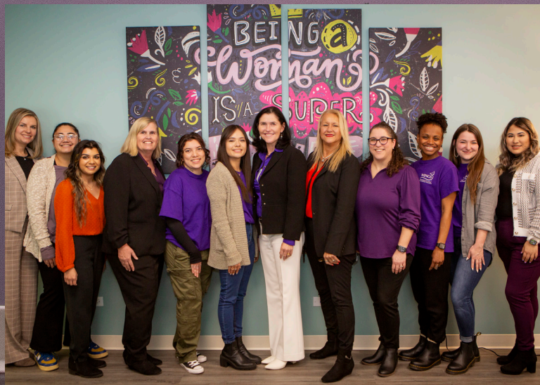
WINGS staff at FFRC

Services are offered in English and Spanish as well as virtual or in-person.