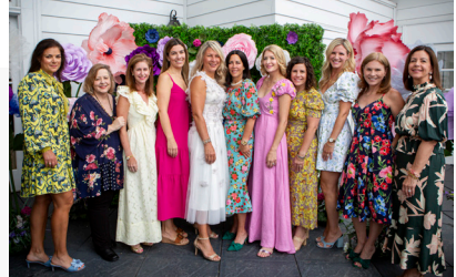
2024 North Shore Ladies Luncheon Host Committee