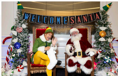
From left to right: Attendees met Buddy the Elf and Santa Claus