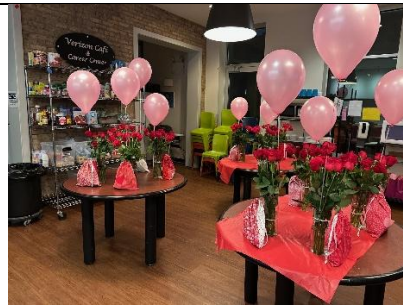
WINGS Metro clients receive special gifts on Valentine's Day organized by former WINGS graduate.