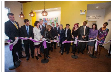
Former Mayor of Chicago Rahm Emanuel cuts the ribbon opening WINGS Metro Safe House in 2016.

Anyone experiencing domestic violence can receive help by calling the 24-hour hotline at 847.221.5680. For more information, visit www.wingsprogram.com .