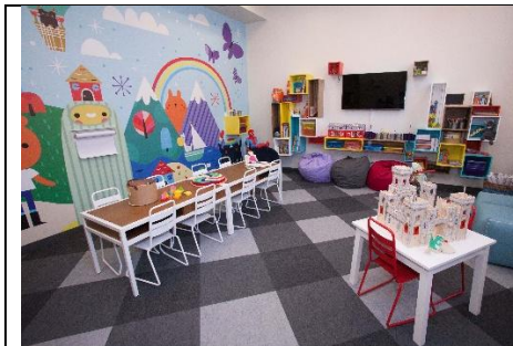
Children's playroom at WINGS Metro Safe House