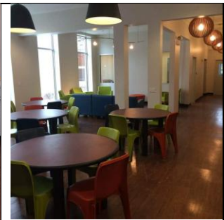
Dining Room at WINGS Metro