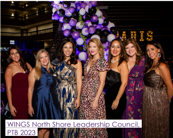
WINGS North Shore Leadership Council, PTB 2023